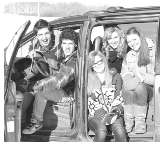
Pure Witness Team 2012-13

Mankind has a decisive need for the witness of courageous and free young people who dare to go counter-current and proclaim strongly and enthusiastically their faith in God, Lord and Saviour. ~ Blessed John Paul the Great ~